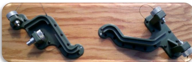
Zero Tolerance "L" Style with Pins